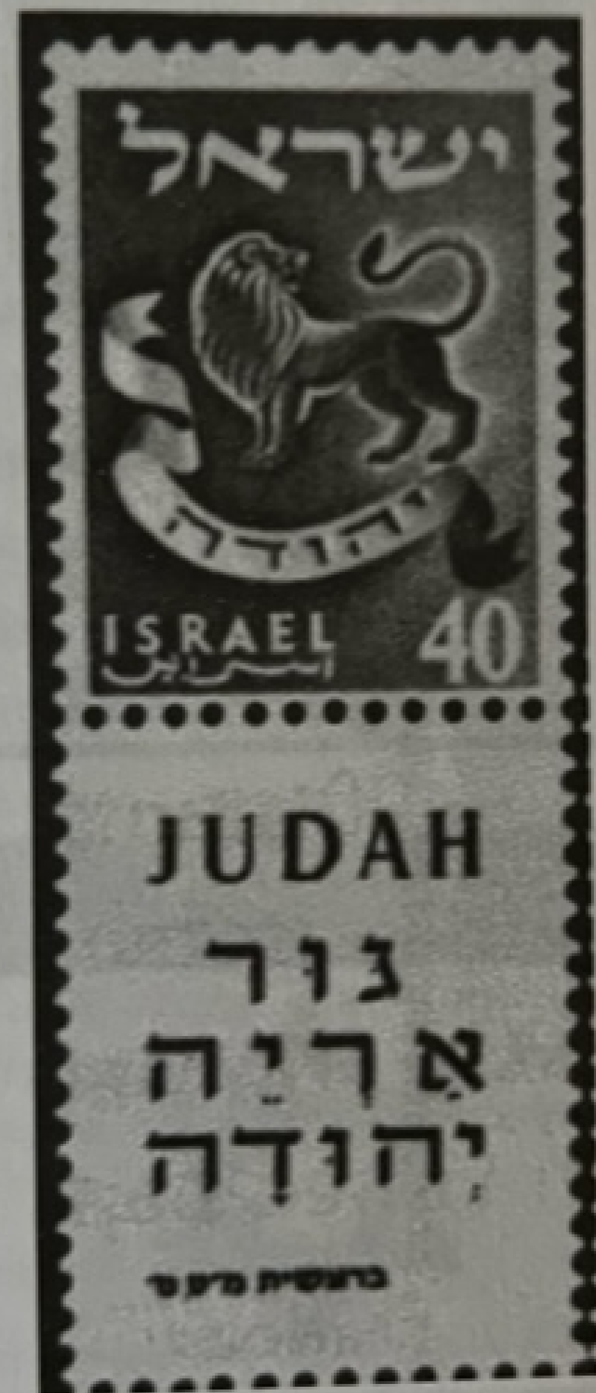
Israeli Stamp Showing The Lion Symbol of Judah